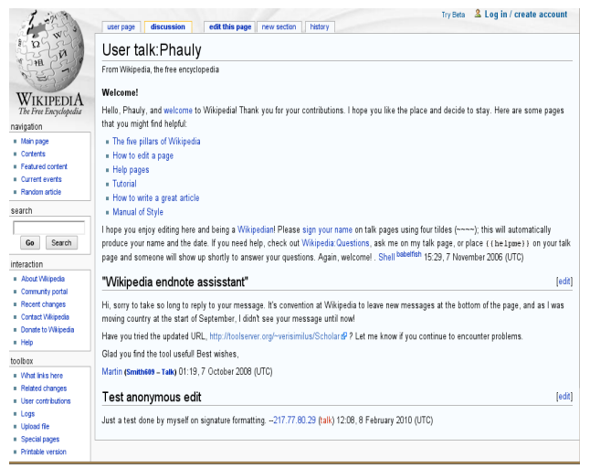
Figure 1: User talk page of user Phauly on English Wikipedia (http://en.wikipedia.org/wiki/User_talk:Phauly)

connections on Youtube is 4.29 while another published work [4] reports it as 6.80. The point here is that depending on how the network is collected, it is possible to infer very different results.